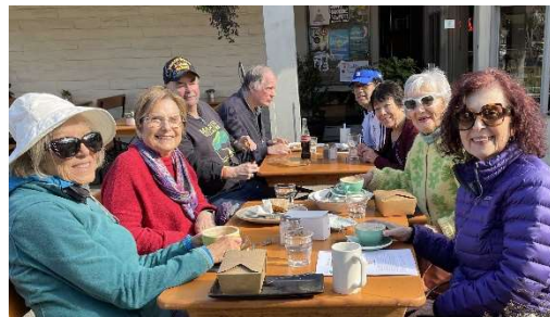
It was a chilly but cheerful day in February at Creekside Bakery