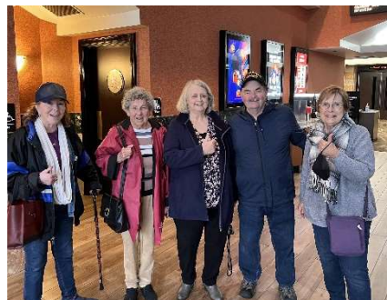
Thumbs up for the movie Bob Marley: One Love!