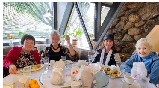
We celebrated the Year of the Dragon at China Palace in February