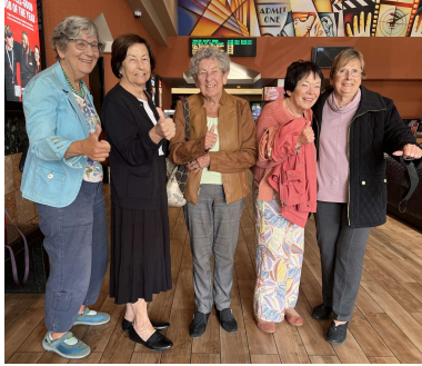
Most voted thumbs up—one “not so sure”