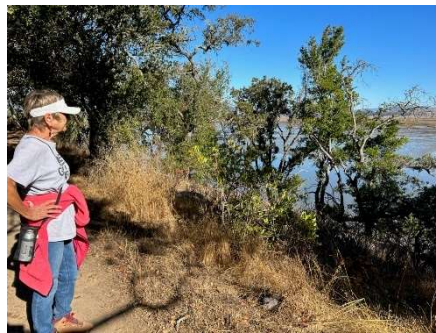
October hike: Bahia Loop Trail