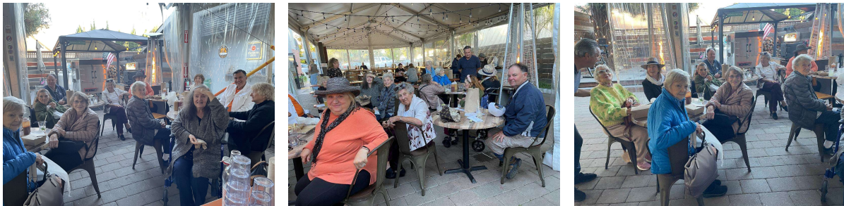
October Happy Hour at Blazers

Watch for the e-blast with the new location and time. The Happy Hour will not be on the fourth Thursday of this month because that date is Thanksgiving. Cheers!