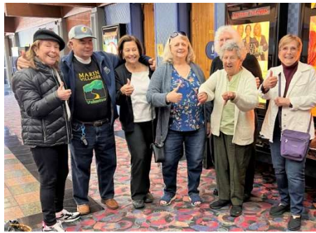
May Village Viewers give thumbs up or thumbs down for BlackBerry