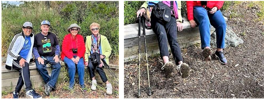
McInnis Levee walk in May—it was a beautiful day but the trail was a bit muddy!

Our walk will be at the Indian Valley Campus of COM. We will start at the Indian Valley COM free parking lot #4 (on the left) just before you get to the large pay parking lot adjacent to the baseball field located at the very end of Ignacio Blvd. The plan is to walk from the parking lot to Indian Valley Rd. The path is wide and will accommodate separations. It's a very level walk—no hills, about 3/4 of a mile round trip. This is a firm, dirt-packed path. Please RSVP to Pat Bailey at pbailey49@aol.com or text or phone (415) 652-9073.