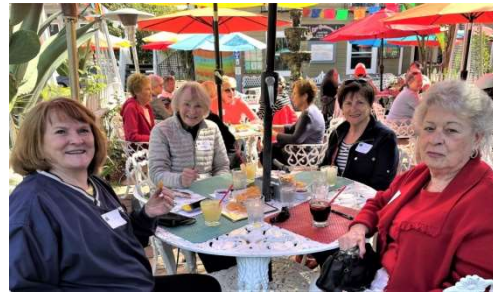
Happy Hour at Las Guitarras in May—a good time for all!