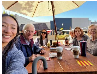
Some of our book club regulars discussing the latest book over coffee and bagels in San Anselmo.