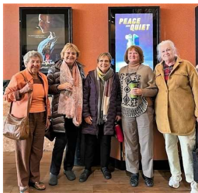
November's movie group!