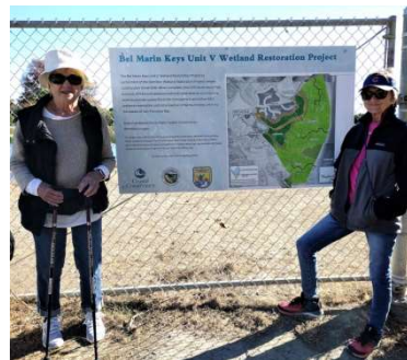
A beautiful walk at the Bel Marin Keys Levee in November