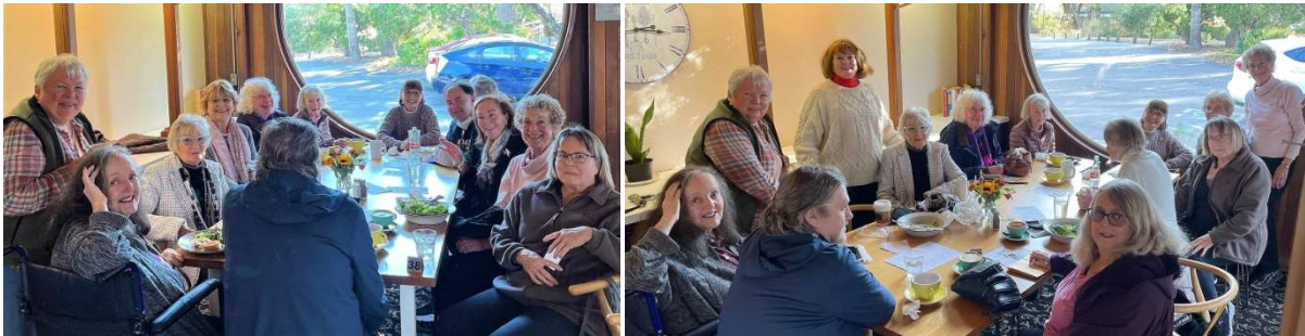
November's Coffee and conversation at Creekside Bakery—always a good time!