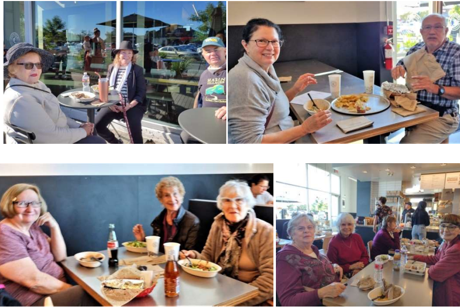
November's lunch at Chipotle Mexican Grill, Vintage Oaks