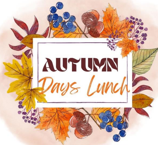
TABLE FOR 8

Insalata's, 120 Sir Francis Drake Blvd, San Anselmo