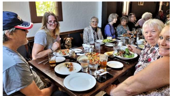
Returning to the Village Pizzeria in July—a popular restaurant!