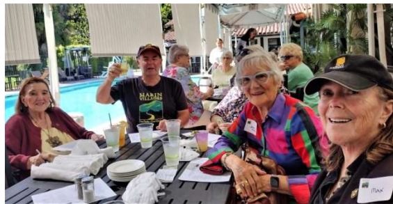
Happy Hour at Rickey's in July!