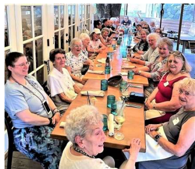
Happy Hour at CRAVE in June!