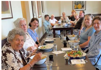
June's CoffeeTea&Chat at Rustic Bakery