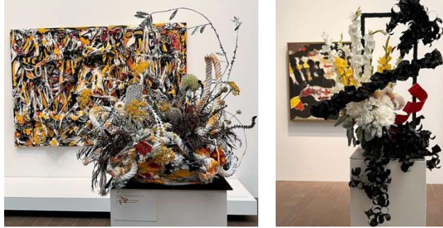
Floral design matches the painting