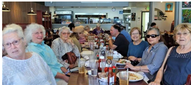
Lunch at Bacon in June—we had over 20 guests!