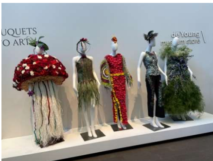
Mannequins dressed in flowers

On June 9 th sixteen Village members and volunteers enjoyed the beauty of the flowers coordinated with the art at the de Young Museum. The group dined in the cafeteria for lunch and had a very pleasant half-day adventure.