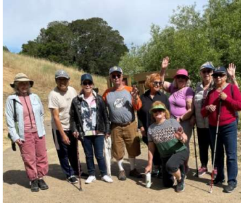
Rush Creek in June—a popular walk!

For anyone who felt that it was a little longer walk than they wanted to do in the past, we can stop at a halfway point and those who wish to go back will have accompaniment to go back to their cars. Reminder: bring water and a hat. There are some shady areas in case it's pretty warm on the day of the walk. Please RSVP to Pat Bailey at pbailey49@aol.com or text or phone (415) 652-9073.