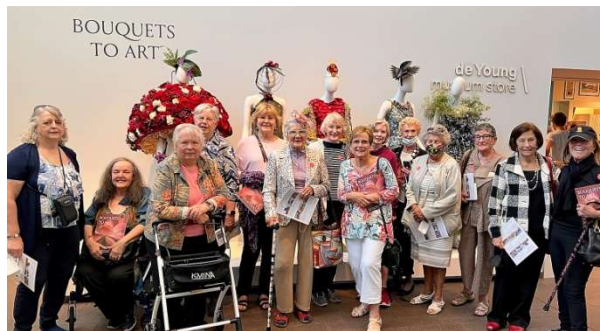
Villagers in front of the mannequins