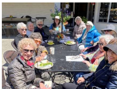
CoffeeTea&Chat in May