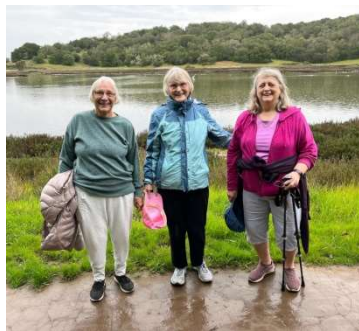
Novato Village Walkers

There are some gravel patches on the mostly level trail. If you have walking sticks, you are welcome to bring them, but they are not required. This easygoing trail follows along rich tidal wetlands. The broad, level Pinheiro Fire Road is popular with hikers, bikers, and equestrians. It offers unimpeded views of a large wetland managed by the California Department of Fish and Game. From the eastern end of the 522-acre preserve, you can look out across the Petaluma River delta to Sonoma County and beyond. Please RSVP so we know how many walkers to expect. Email pbailey49@aol.com or call Pat Bailey's mobile phone (415) 652-9073 to reply or ask any questions about the location and parking.