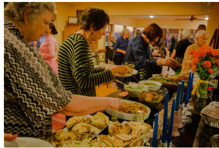
Enjoying the Diwali feast