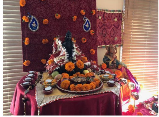
The altar for Lakshmi and Ganesh, Hindu gods