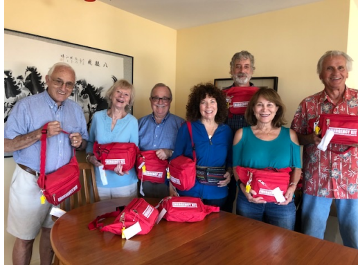
Members of the Tiburon Sunset Rotary and Marin Villages display the emergency kits