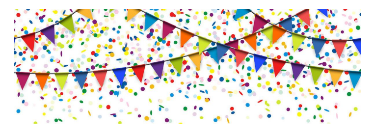
SAVE THE DATE "10 Years Together" -- A Marin Villages Anniversary Event September 8th, 3 - 5:00pm

Put this fun event on your calendar now. We hope you can join us as we celebrate all of you members, volunteers, donors and supporters who have made Marin Villages the vibrant community it has become. We will celebrate our 10th Anniversary milestone by thanking all of you who have made it "happen".