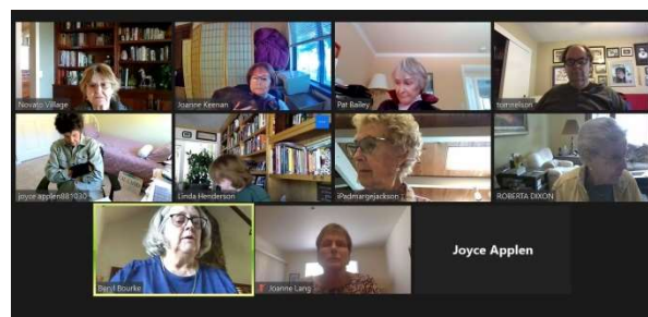
April Steering Committee meeting