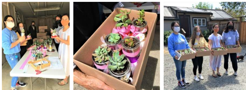
OWLS work with volunteers from Novato Village Steering Committee to plant the succulents for Novato Village members—Happy May Day!

Novato Village and Soroptimist youth group OWLS ( O ppportunity for W omen in L eadership and S ervice) teamed up again for the May Day succulents project. We hope you enjoy the gift and think of May Day as it was over a century ago, and is still celebrated in the traditional way in many European countries. The earliest known May celebrations appeared with the Floralia , festival of Flora , the Roman goddess of flowers, held from 27 April – 3 May during the Roman Republic era (Wikipedia). Although fading in popularity since the late 20th century, we have shared the tradition of giving of "May baskets," small baskets of sweets or flowers, usually left anonymously on neighbors' doorsteps—or in this case, given to our members in person.