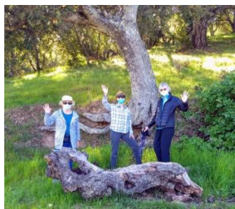
We found wildflowers on our walk at Rush Creek in April.