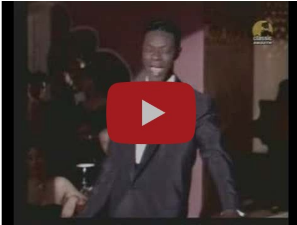
Nat King Cole – When I Fall In Love