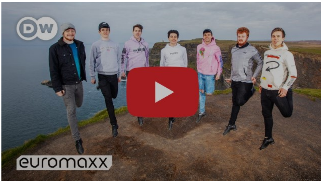
How These 7 Irish Lads Went Viral With Their Dance Videos – The Tradition of Riverdance

Cairde. Irish dance with a modern twist. Short documentary. (below)