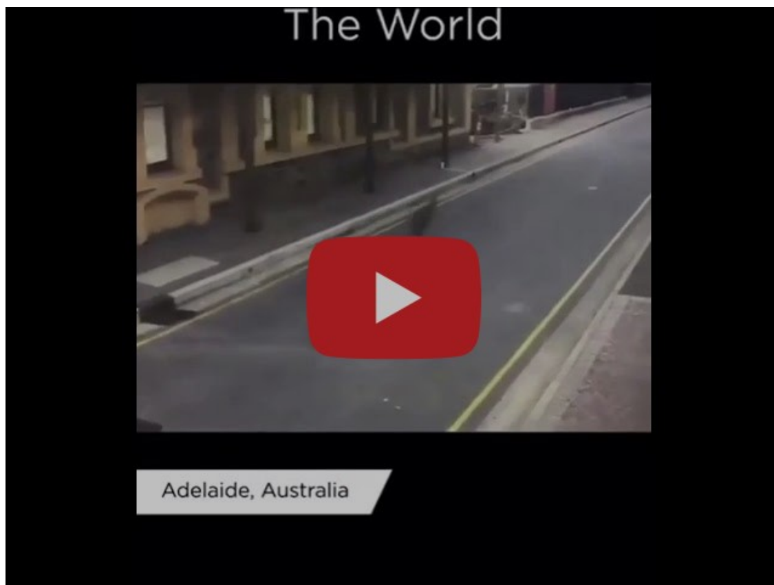
Animals having a good time

Renovating a tiny castle . For you DIYers, think about what fun this guy had. Wonder if he got it sold?