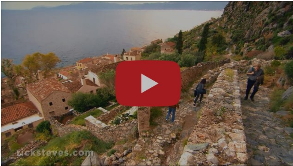
Peloponnese, Greece: Magnificent Monemvasia

Monemvasia, Greece. A Rick Steves moment. (below)