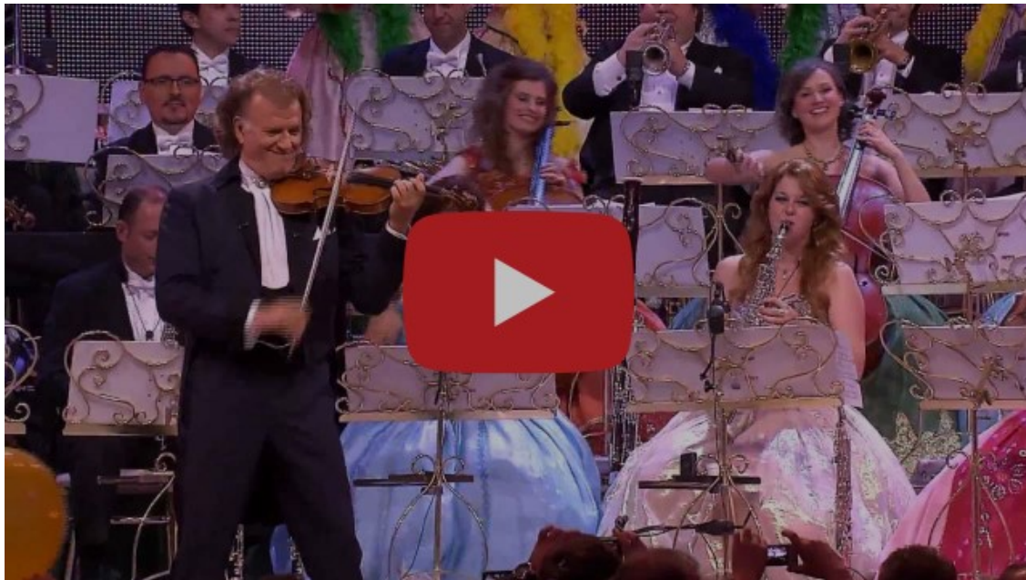
André Rieu, Brazil Medley

In honor of our new ED, who hails originally from Brazil, how about this lively medley of Brazilian music!