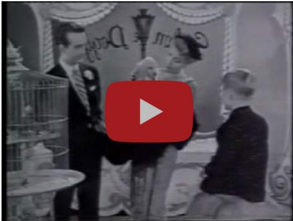
How Much is that Doggie in the Window? – Patti Page

How Much is that Doggie in the Window – Patti Page