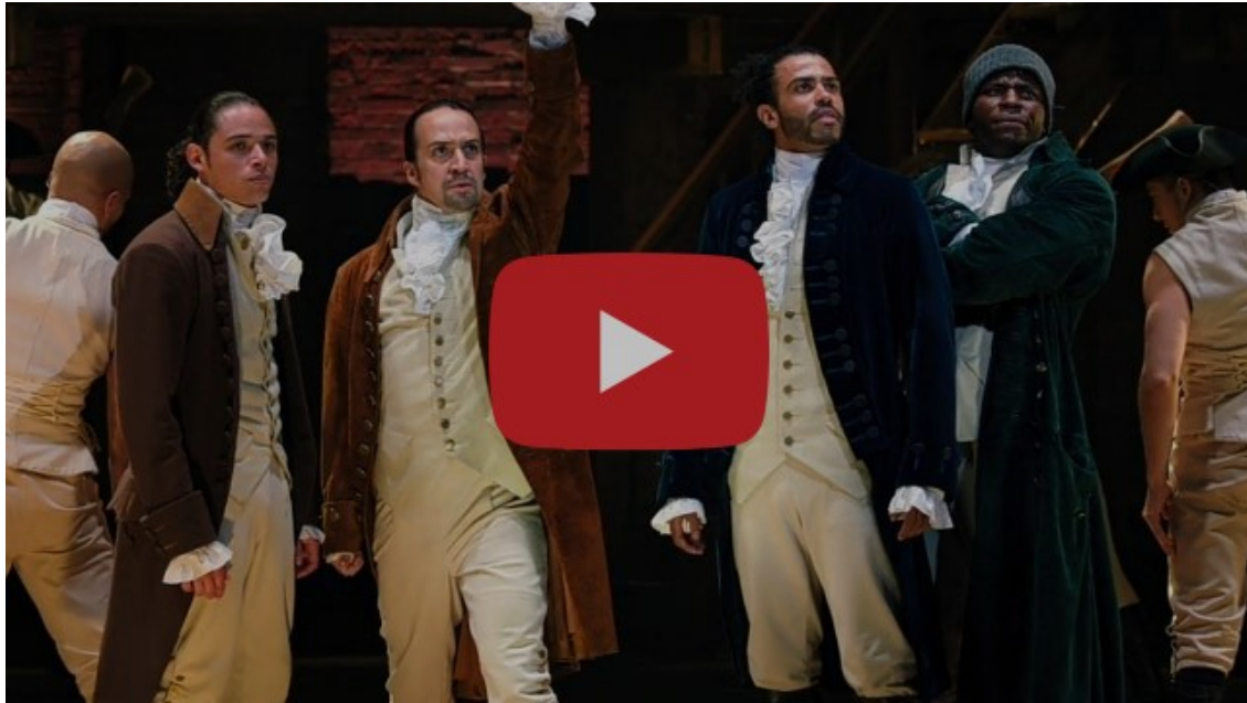
My Shot: Hamilton , the musical

Lots of focus on getting shots right now. Hope this rousing rendition of My Shot from Hamilton helps everyone get geared up for vaccination (not revolution)!