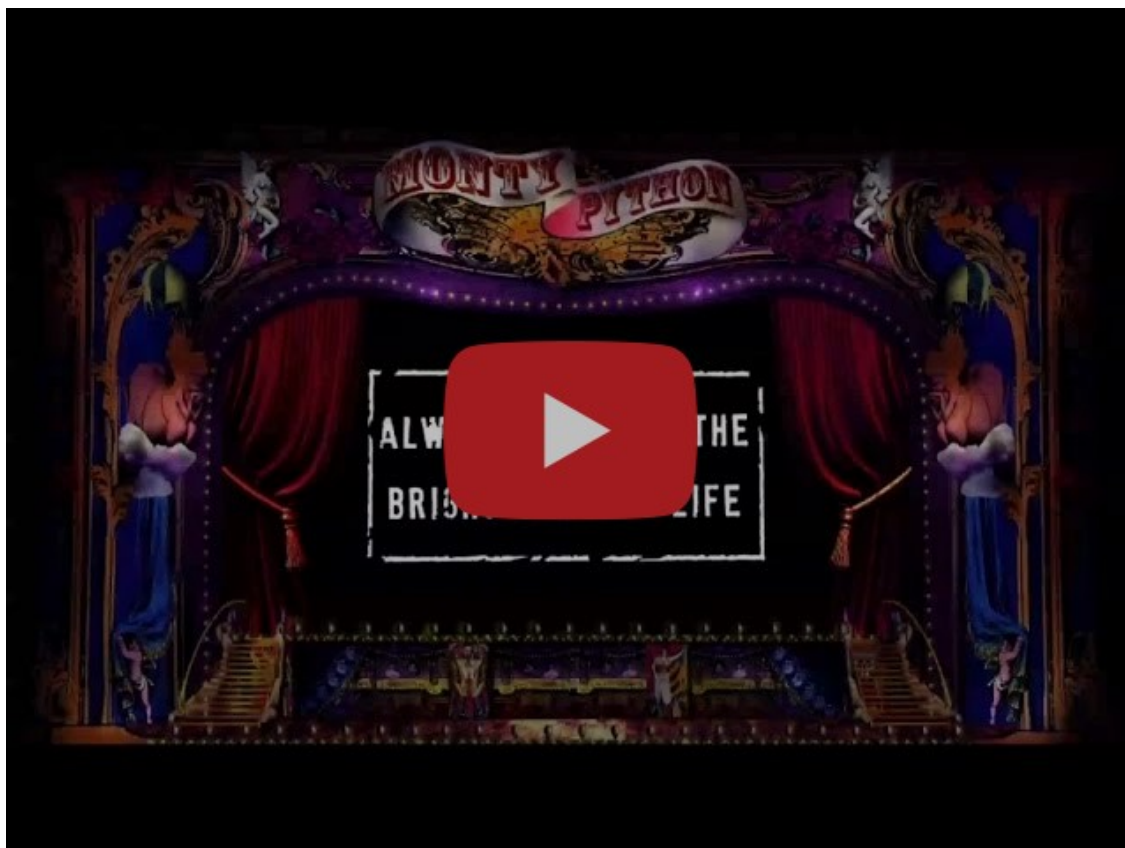
Monty Python: Always Look on the Bright Side of Life