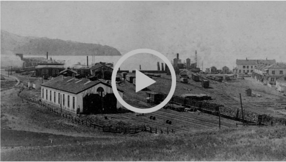
Railroad to Condos – The Development of Downtown Tiburon, California