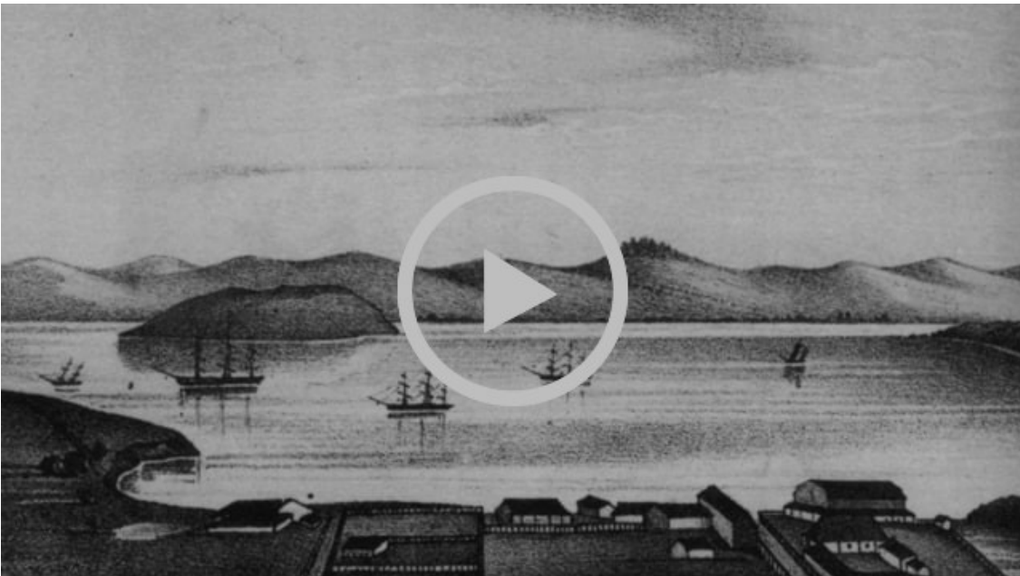
Turning the Tide Chapter 1 – A Little History