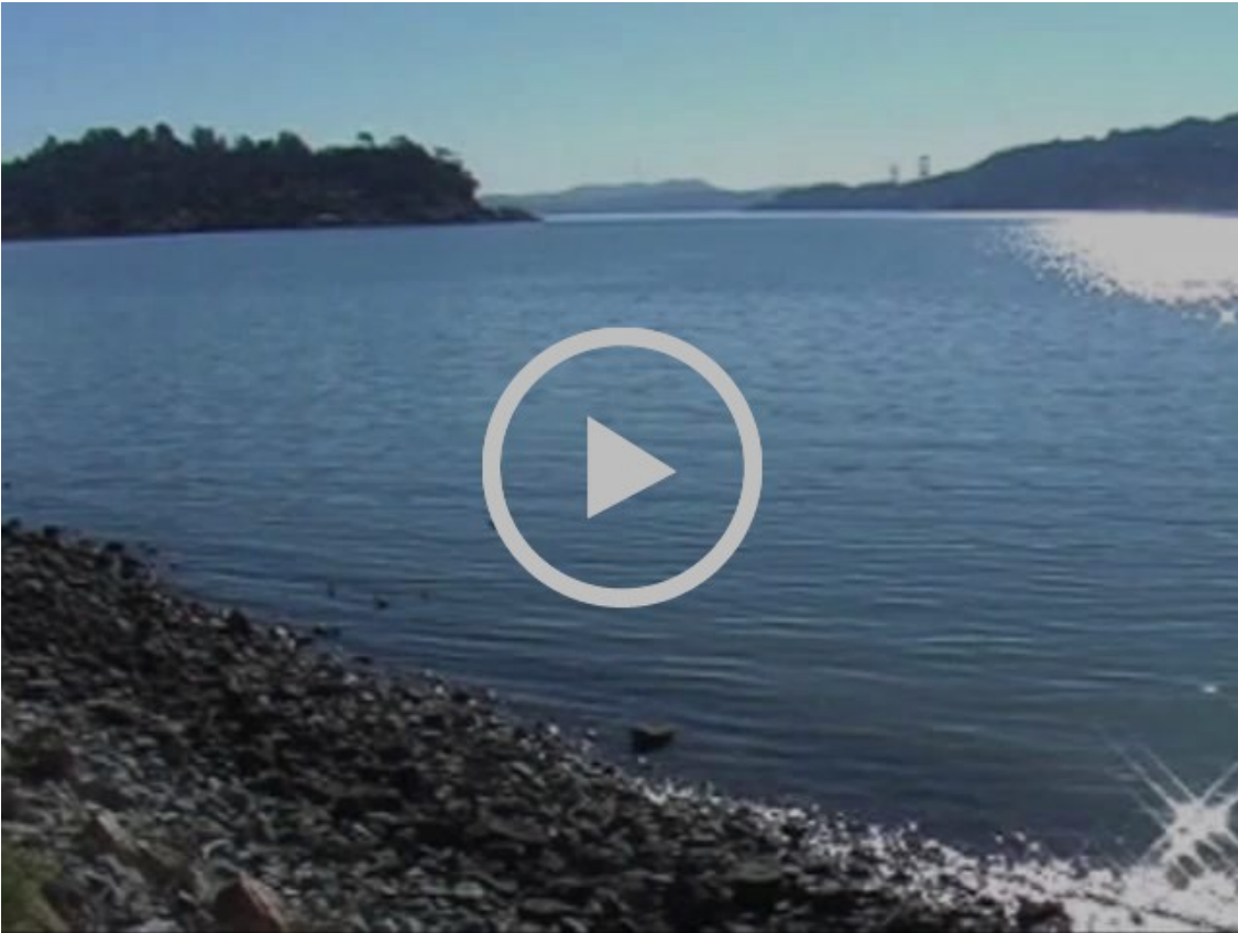
Turning the Tide – Intro