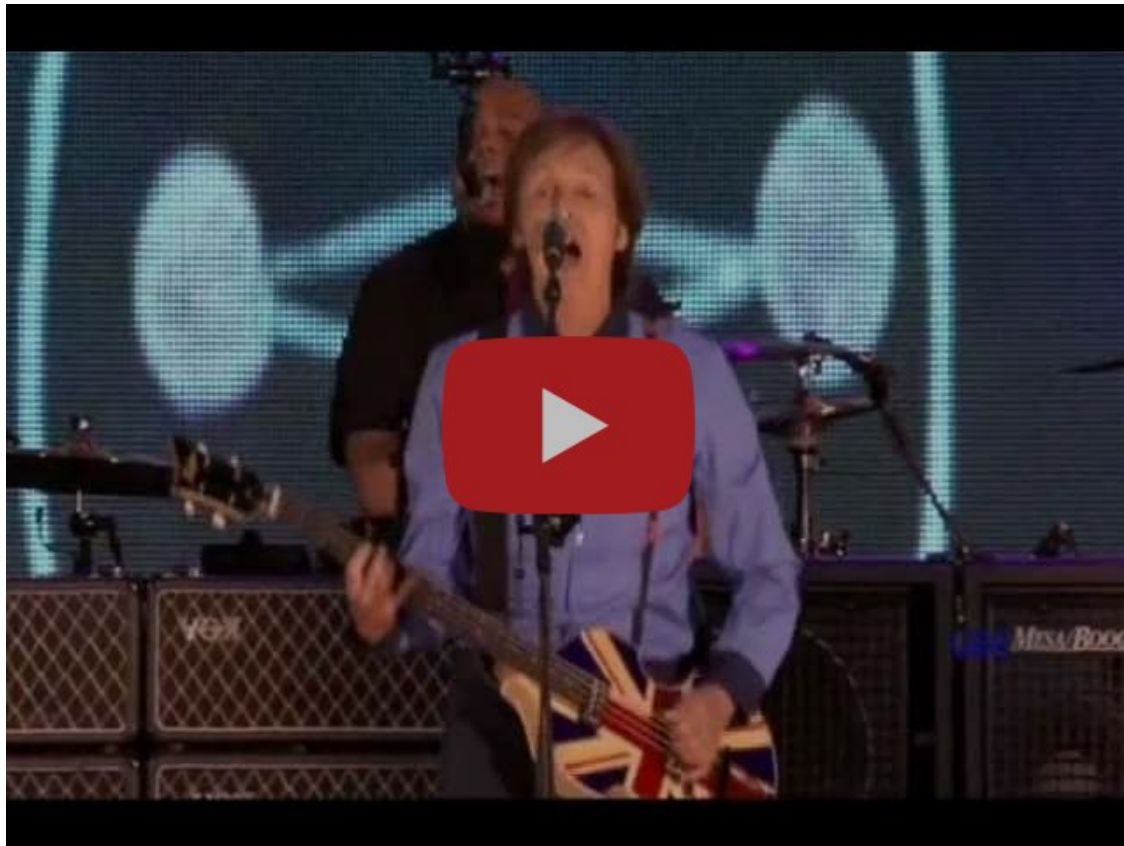
Paul McCartney: Ob-La-Di, Ob-La-Da

In light of all the rhetoric flying back and forth, and crazy stuff we are dealing with, perhaps these words will be a refreshing change. From the Queen of England's Jubilee celebration a few years back.