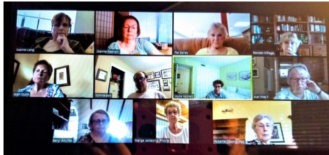
Novato Village Steering Committee hard at work via Zoom on August 18